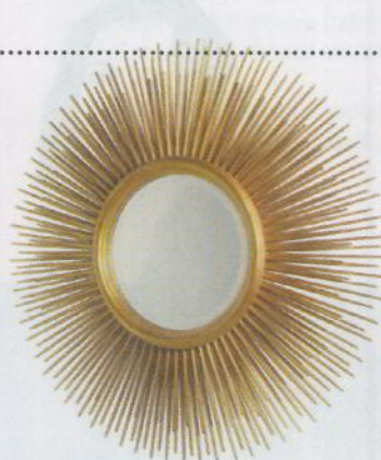
At 49 inches, the Barrymore Starburst Mirror can easily hold its own over a mantel or hang in a group for even greater impact.